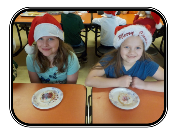
RES students decorated cookies. They handed cookies out when they were caroling , and also enjoyed them as a treat!